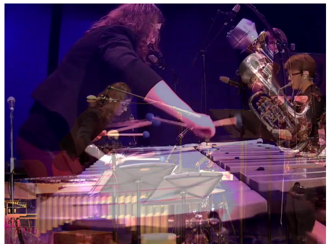
Bring the Noise by Shaun Tilburg